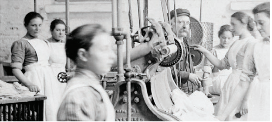
Girls in the school laundry, late 1800s

accommodate 200 pupils, with a new workroom, sick room, chapel and refectory (the present foyer). During the 19th century the school continued to grow with support from local people, including former pupils who had gone on to become wealthy. There were many alterations to the building during this period, the school expanding up School Lane and along Hanover Street.