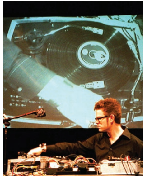
Janek Schaefer performance, 2009

The 1980s and 90s witnessed more ambitious gallery programming by Bluecoat – collaborative commissions with UK venues such as London's ICA and the Arnolfini in Bristol, with exhibitions like Trophies of Empire (1992); hosting national touring exhibitions like Women's Images of Men (1981); initiating its own touring shows; international projects, including an exchange programme with Liverpool's German twin city of Cologne. With the arrival as tenants of Merseyside Moviola (now FACT) and its Video Positive festivals, Bluecoat provided a showcase for moving image and new media art. Off-site installations took art out of the building into the city centre, while the venue became home for more experimental 'live art' performance. This period also saw an opening up of the