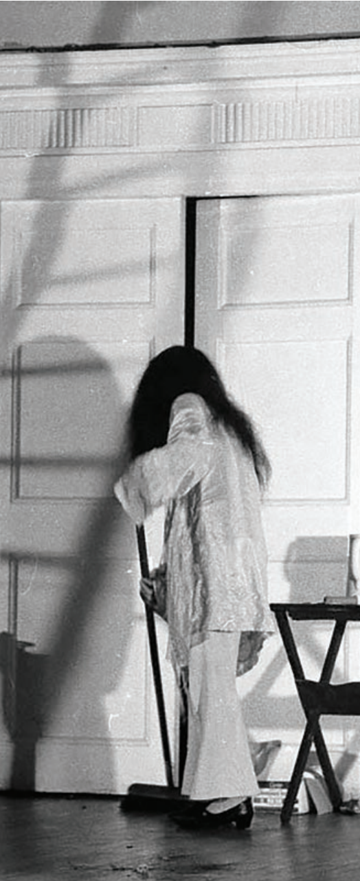
Yoko Ono, performing at Bluecoat in 1967.

Towards the end of the 1960s, an adventurous programme reflected the experimentation of a new generation of British and international artists breaking new ground in poetry, jazz and other music, in performance and visual art. This echoed the Sandon's early radicalism and showed what was still possible in a venue that, after its restoration, had tended to be regarded as artistically conservative.