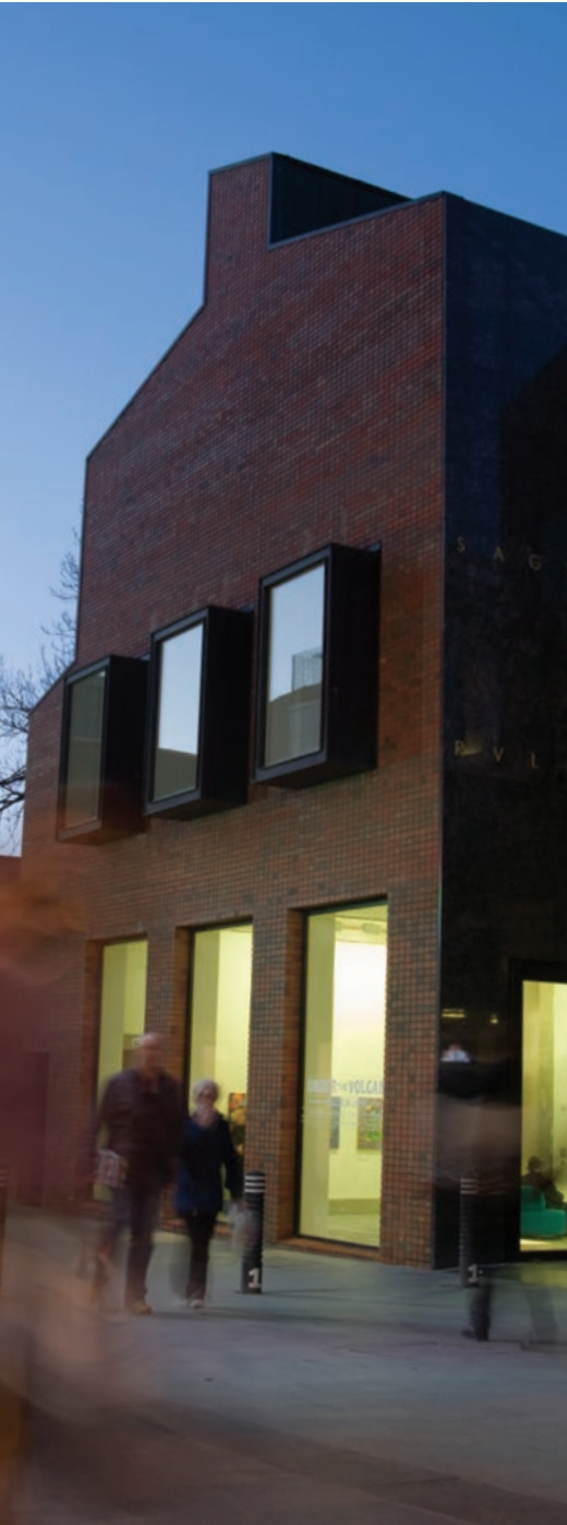
New arts wing, 2009.

Bluecoat's capital development, completed in 2008 - designed by Biq Architecten, of Rotterdam - was the first comprehensive renovation and restoration in fifty years. It brought a new arts wing, comprising purpose built galleries and performance space, reorganisation of interior spaces, and access improvements. The project also uncovered and restored historic features long buried behind plasterboard. The ground floor foyer was opened up to reflect its earlier design, revealing cast iron pillars and oak beams from the 19th century. In the gallery, a section of original brickwork has been left visible to reveal evidence of the building's changes.