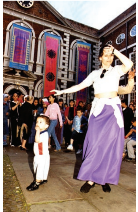
Liverpool Arab Arts Festival at Bluecoat.

Contemporary dance also has a long tradition at the venue, which is currently home to dance artists Liverpool Improvisation Collective. Literature too is part of the offer, an interest stretching back to the Sandon, whose members included early science fiction writer Olaf Stapledon. Hundreds of artists and creative organisations have been supported and nurtured in different ways at Bluecoat. Many well-known visual artists presented work here early in their career, including future Turner Prize winner Jeremy Deller, commissioned by Bluecoat for Acid Brass , in which acid house anthems were re-arranged for the country's leading brass band. This experimental cross-art form working, and giving artists opportunities to try new things, is very much central to Bluecoat's work today.