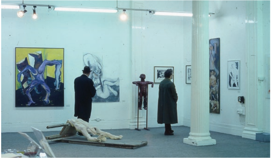
Women's Images of Men exhibition, 1981

Arab Arts Festival, which Bluecoat set up in 1998 with Liverpool Arabic Centre, and deaf and disability arts festival DaDaFest - the latter two organisations based in the building. Bluecoat has been a partner in the Liverpool Biennial of Contemporary Art since its inception in 1999.