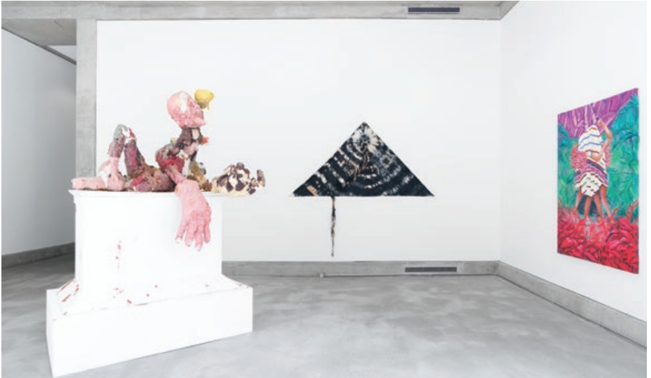
Bloomberg New Contemporaries exhibition 2016

leading US jazz players such as Sun Ra. The building has hosted an eclectic mix of music – folk, rock, reggae, electronica, indie and roots – and is home to instrument makers, music workshops and choirs such as Sense of Sound and The Choir with no Name.