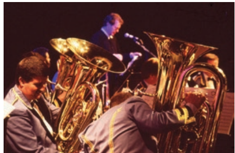
Jeremy Deller, Acid Brass , a Bluecoat commission staged at LIPA, 1997. MC Tony Wilson, centre

Bluecoat remains central to the city's cultural life, a symbol of Liverpool's resilience and historical significance as a global port. It is as relevant now to the regeneration of Liverpool as it was to the town's 18th century aspirations.